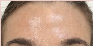
The most popular treatment using Botox is to smooth glabella/forehead lines. The result lasts approximately three to four months and usually costs $300 to $500.