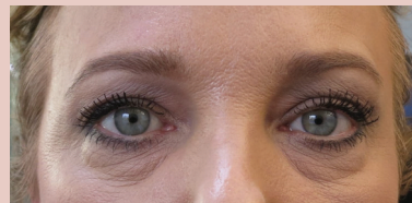
Before upper and lower lids surgery

Facial injections complement surgery results. This patient had upper eyelids blepharoplasty (skin removal with crease fixation) and Dr. Lee's minimally invasive suture brow lift. Botox treatment was performed to forehead and crows' feet area to complement her surgery results. Additionally, one syringe of Voluma was used to correct lower lids/cheeks hollowness, and one syringe of Juvéderm was used to soften the jowl and chin area.