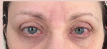
After upper eyelids skin removal with crease fixation, upper muscle mullerectomy, and lower lids fat removal with skin tightening