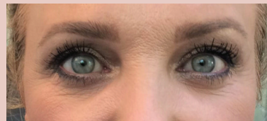
After upper eyelids skin removal with crease fixation, and lower lids fat removal with skin tightening